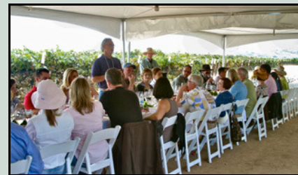
The Feast is served!